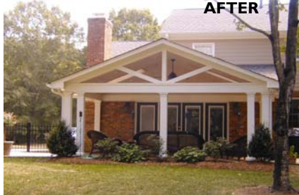
Some Changes are worth staying Home ....or will bring a better offer.