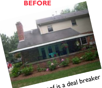
Metal porch roof is a deal breaker